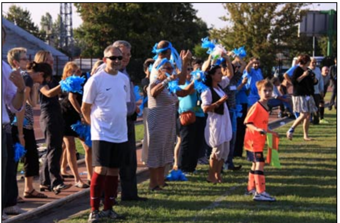
WATCH OUT THE GUY!