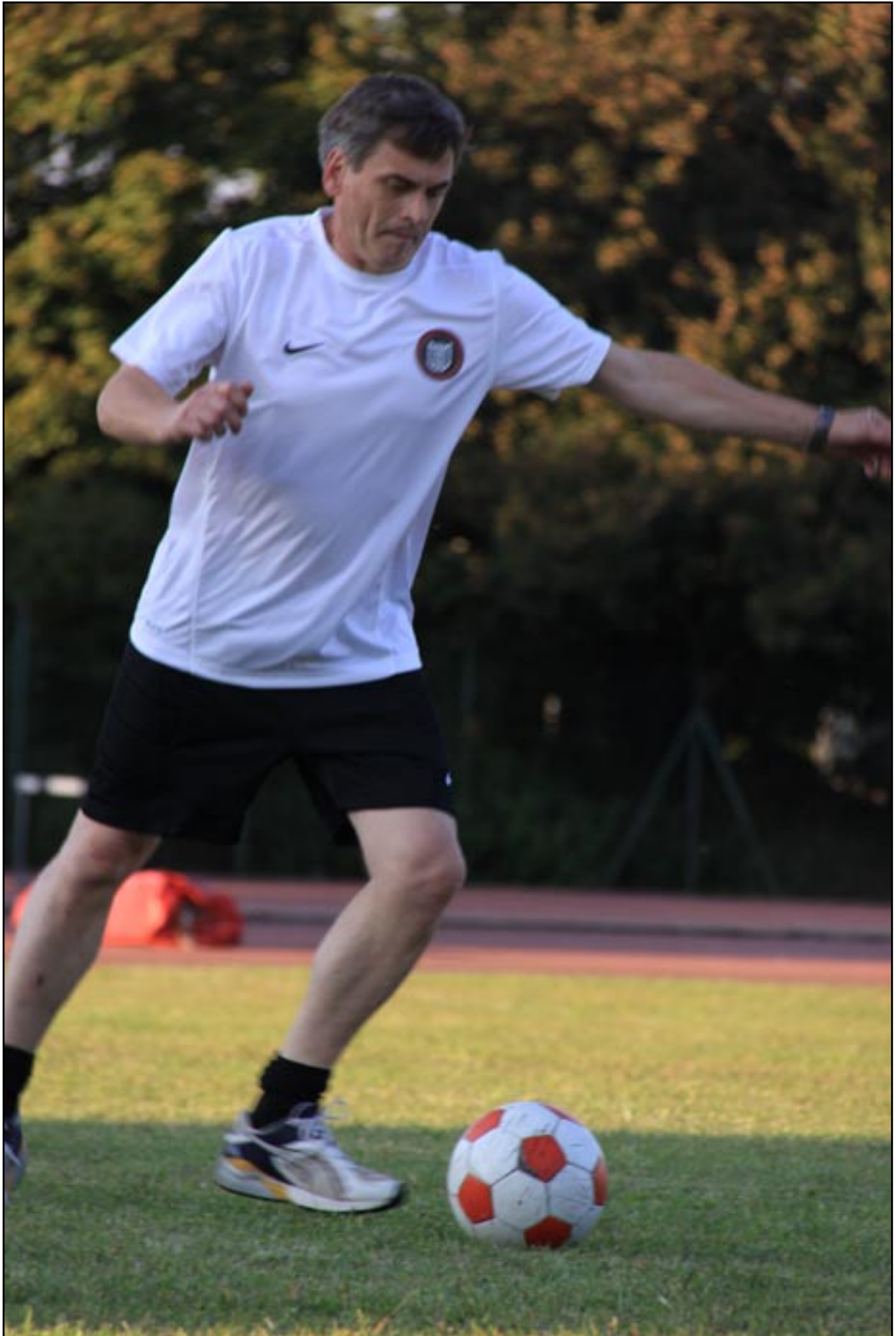
THE ART OF DRIBBLING