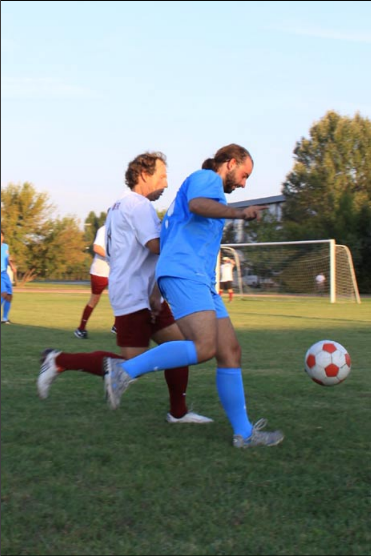
GOOD DEFENSE AND ATTACK