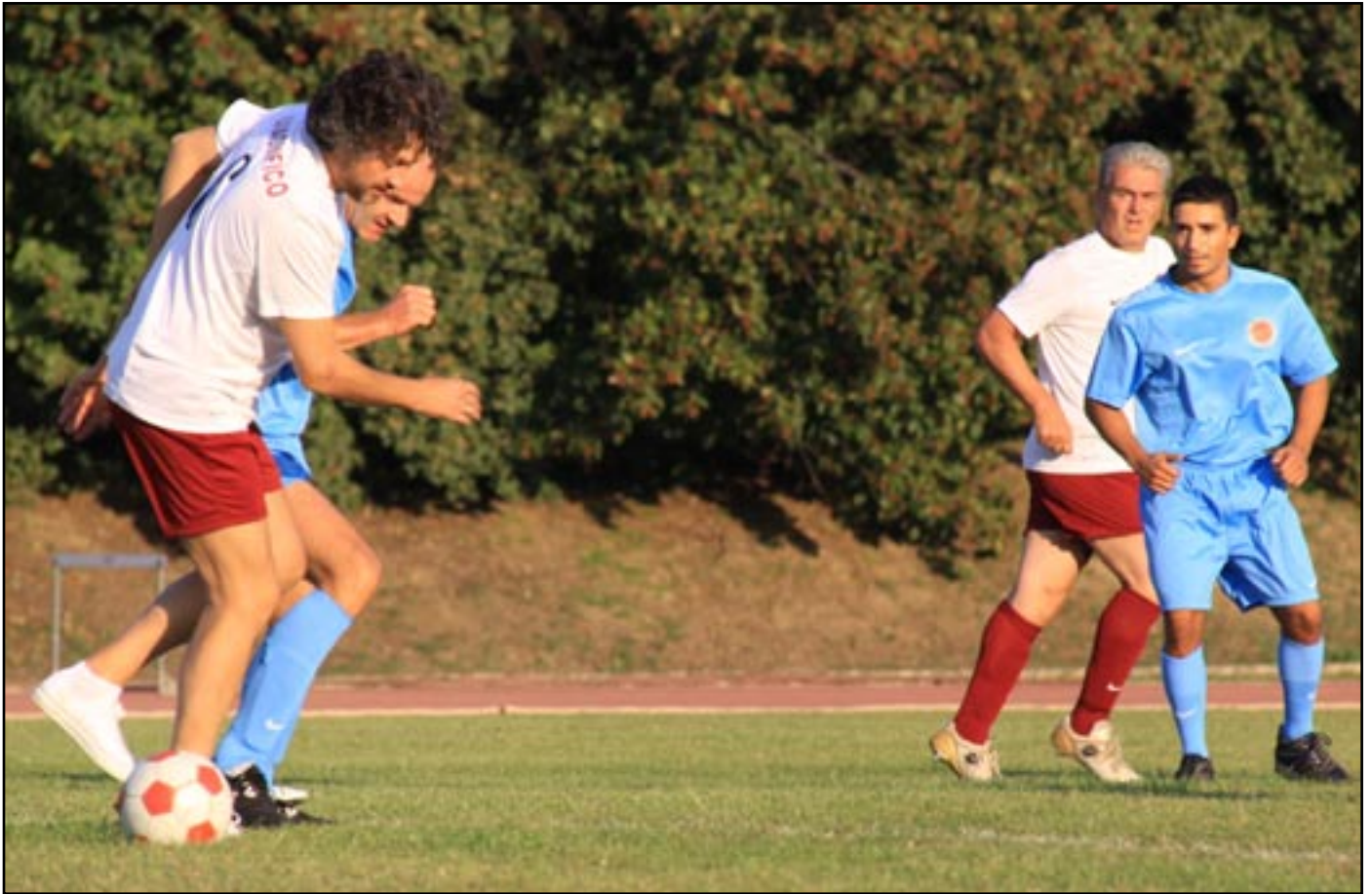
CONTRASTS AND KICKS