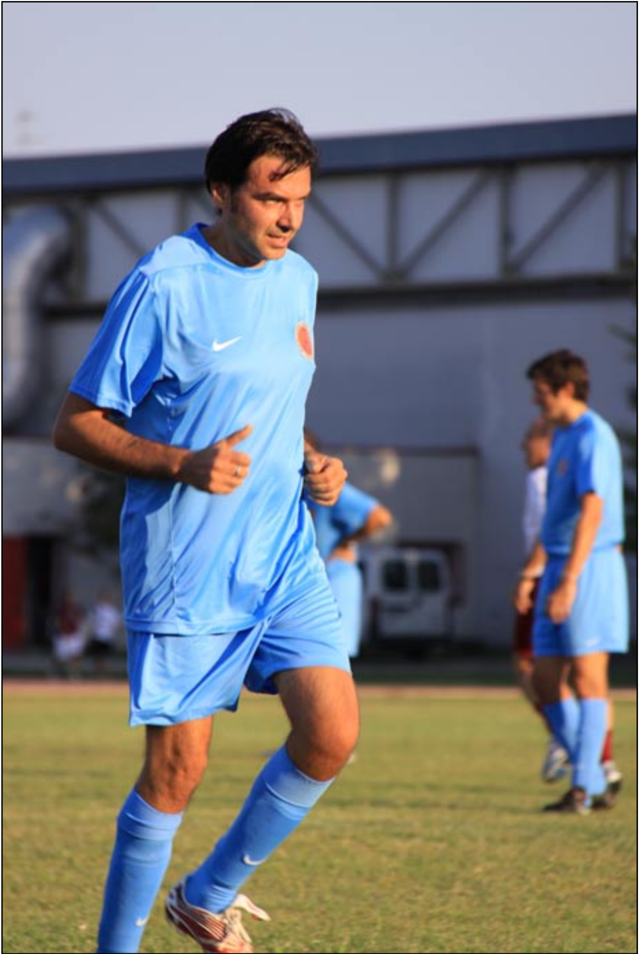
THE GOAL THAT NOBODY SAW 4 - 1