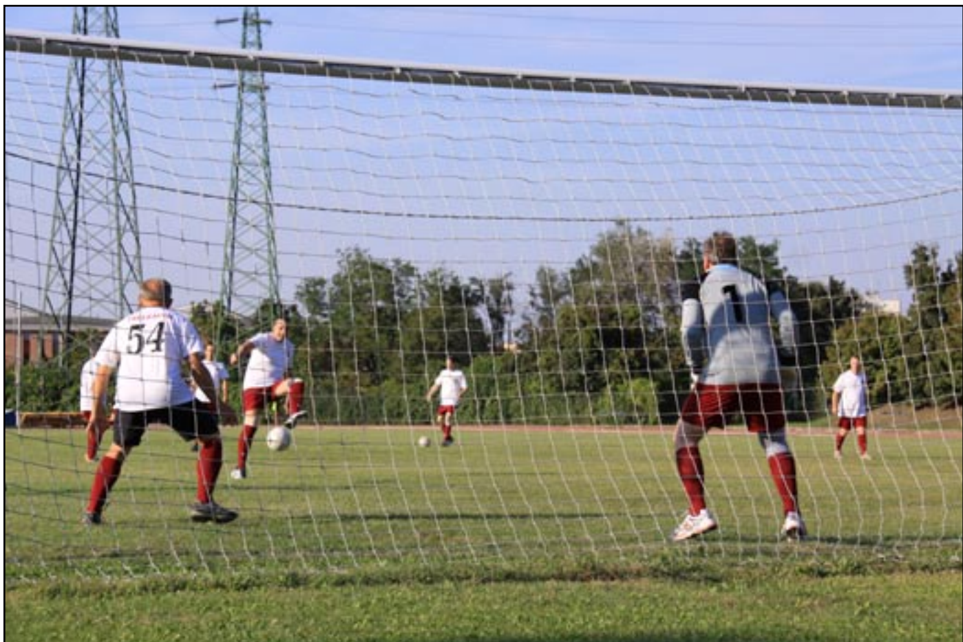
WARM UP FOR GOALKEEPERS