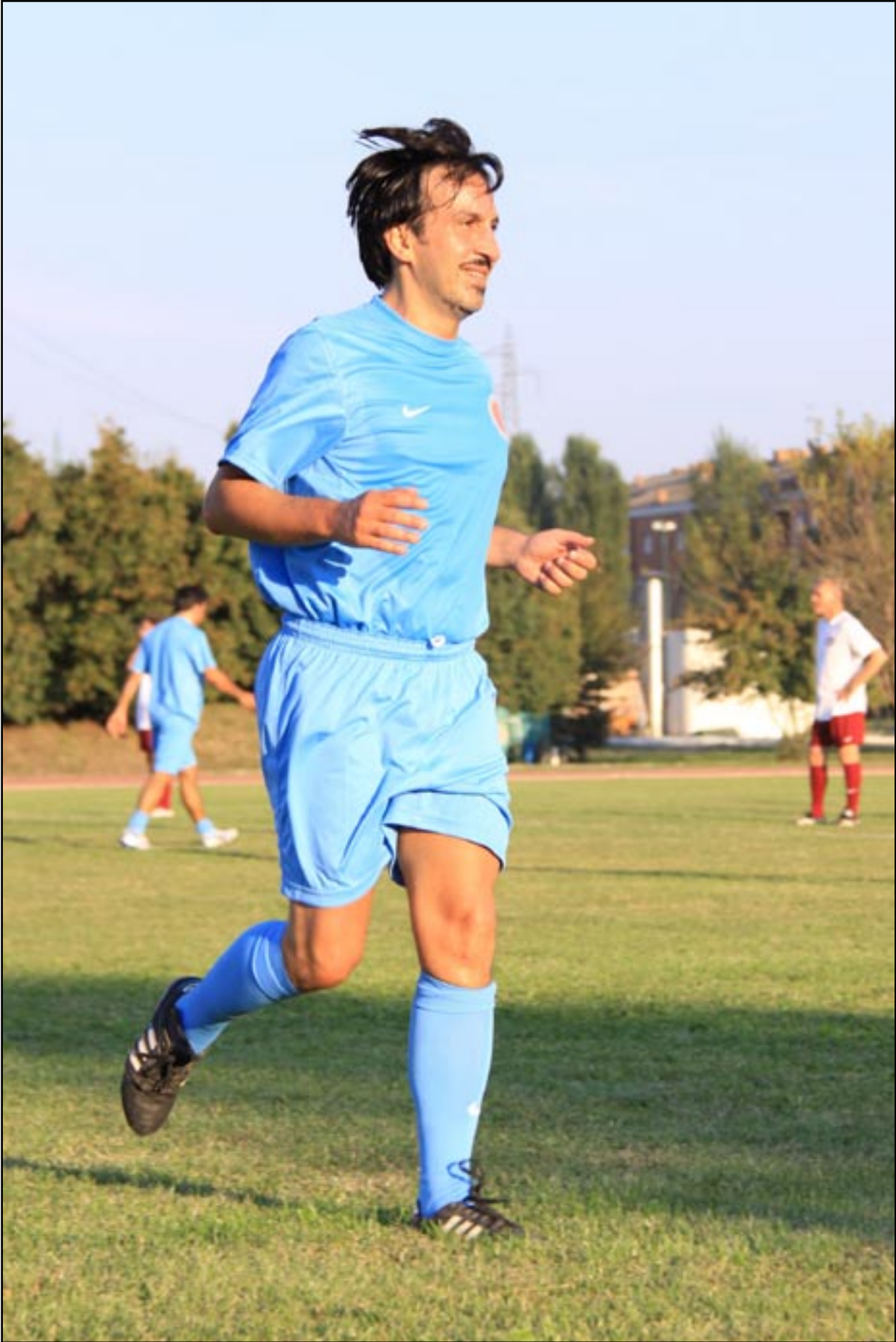
WELL DONE, GUY!