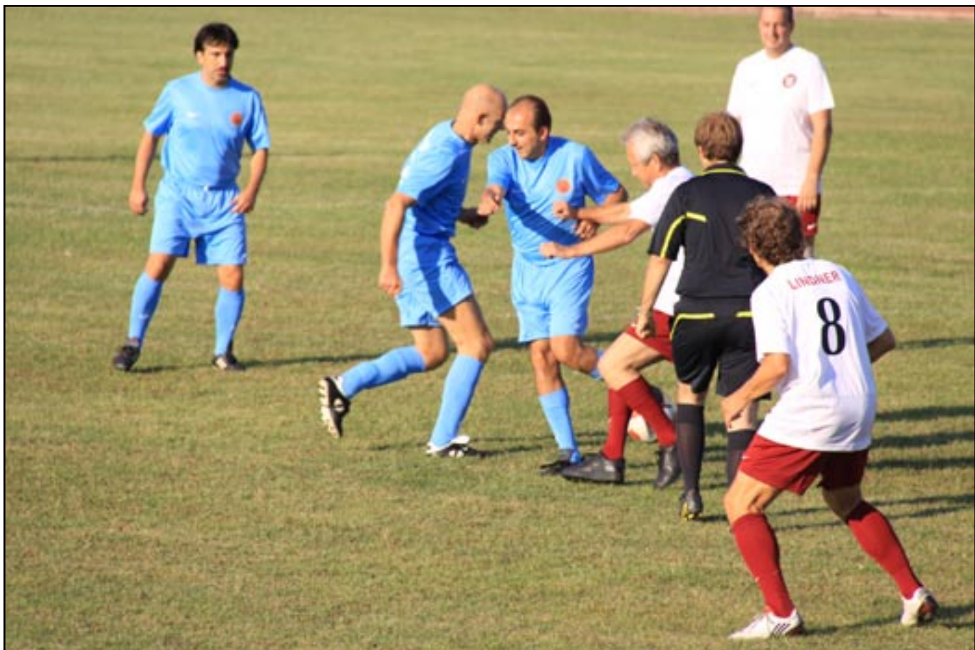
BATTLE IN THE MIDFIELD