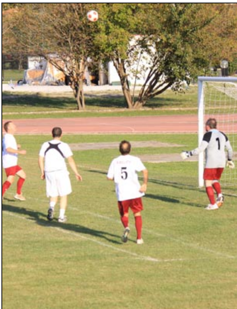
THE BALL IS OUT