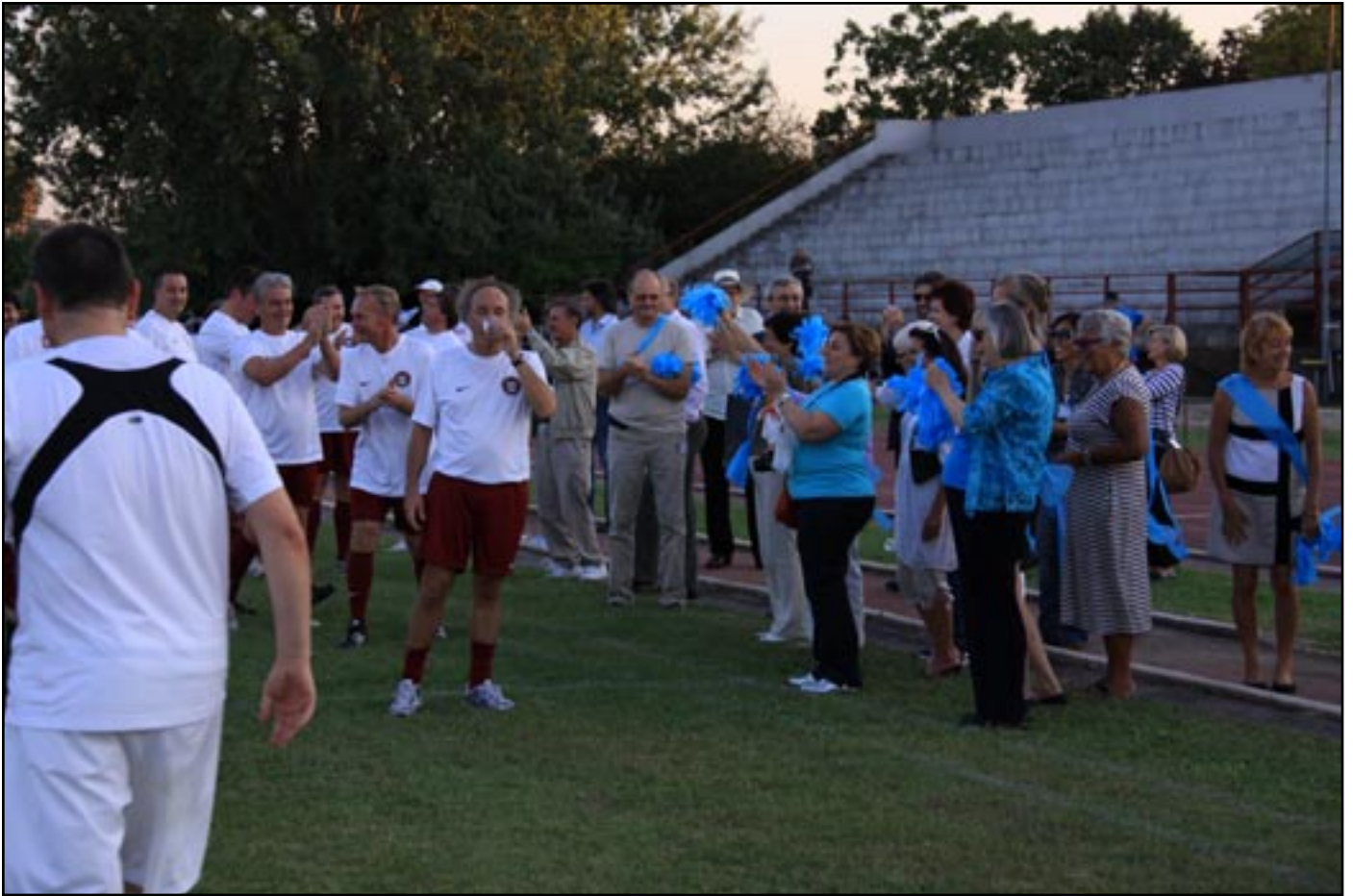
APPLAUSES AND DRINKS