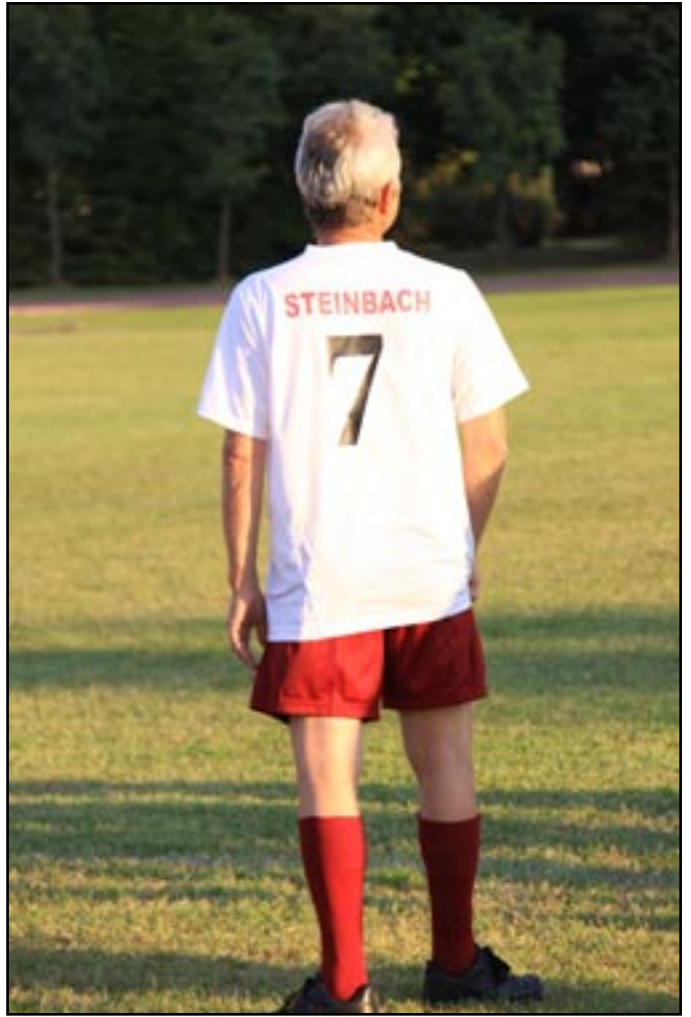
IT'S TIME TO PLAY AGAIN