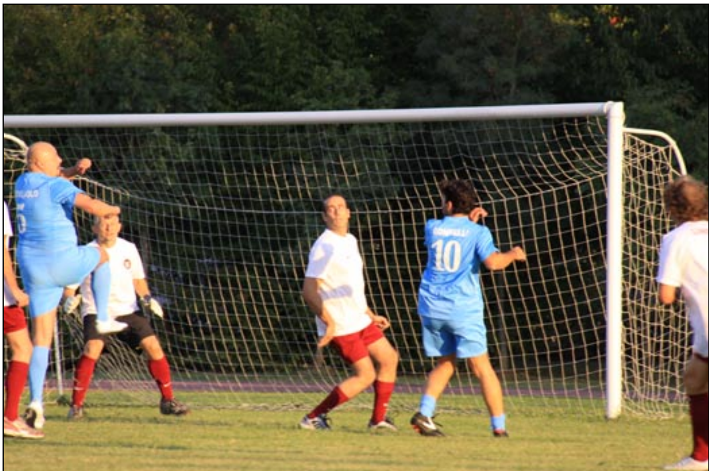
CROSS AND HEAD SHOT: GOOOOOOAL! 5 - 1