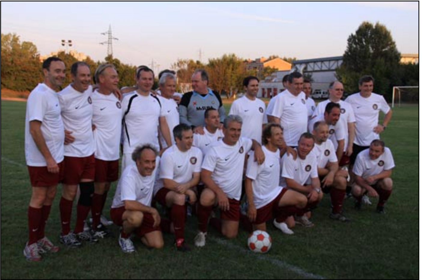
REST OF THE WORLD TEAM