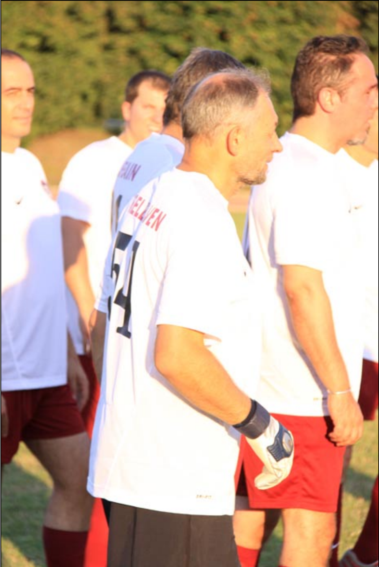
WHAT IS THE COACH SAYING?