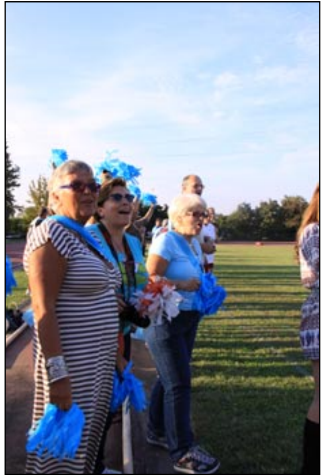
OUR FAVOURITE CHEERLEADERS