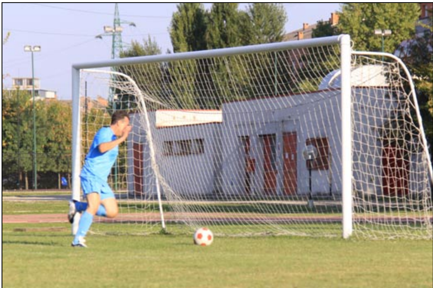
“TOCCATA” AND FUGUE