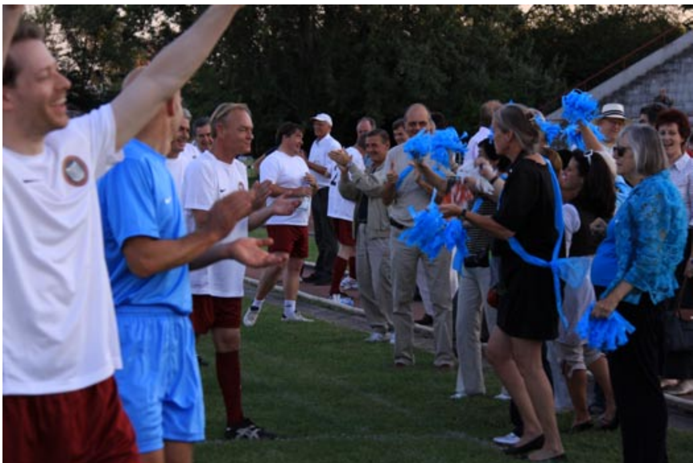
GREAT PLAYERS FOR BEAUTIFUL PEOPLE