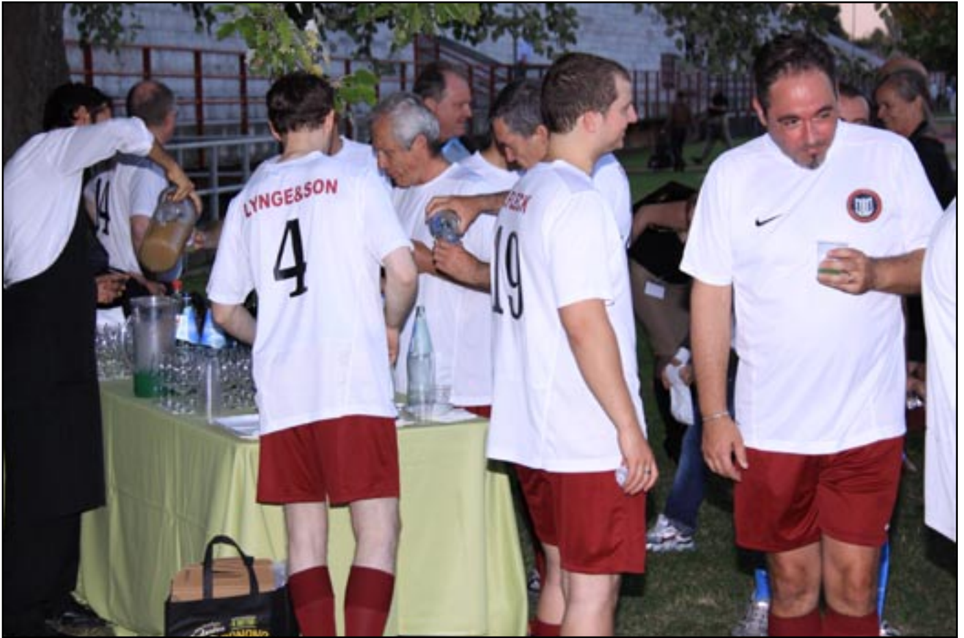
DRINKS FOR ALL