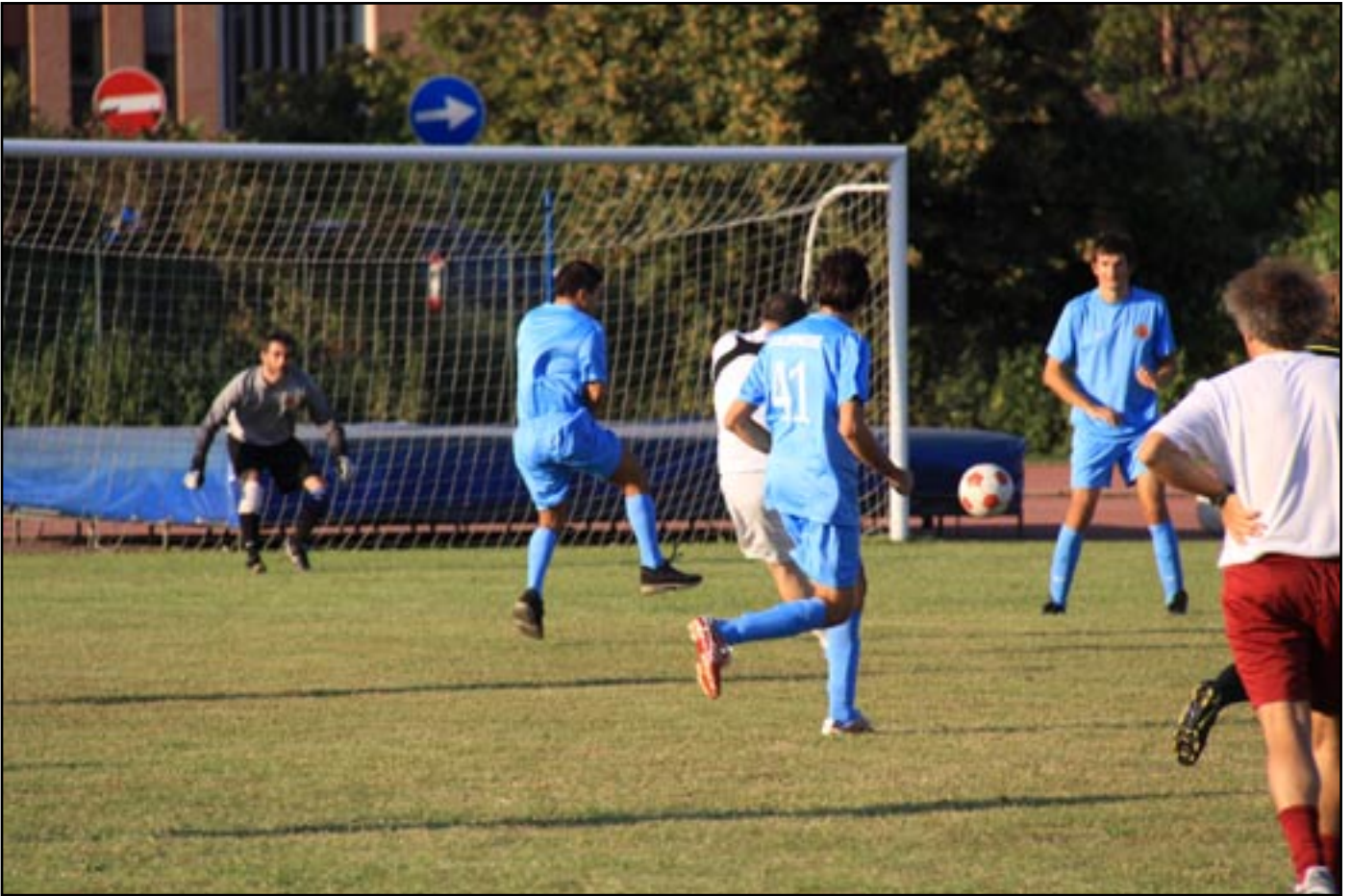
REST OF THE WORLD IMMEDIATE COUNTER ATTACK