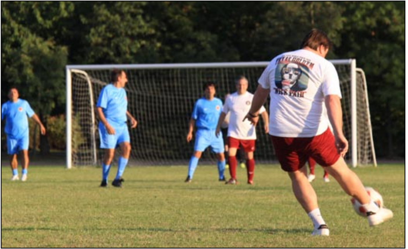
STRONG ATTACK AND DEFENSE