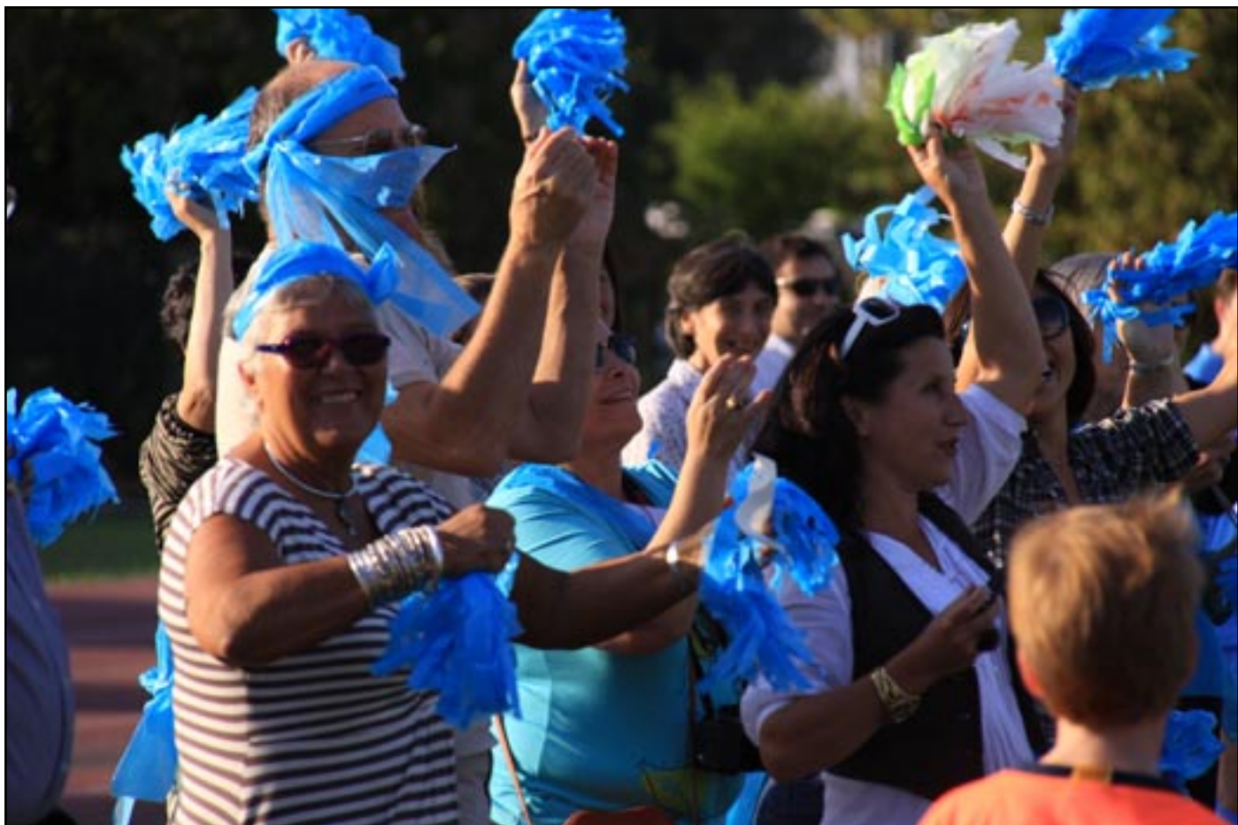
THE BEST CHEERLEADERS IN THE WORLD