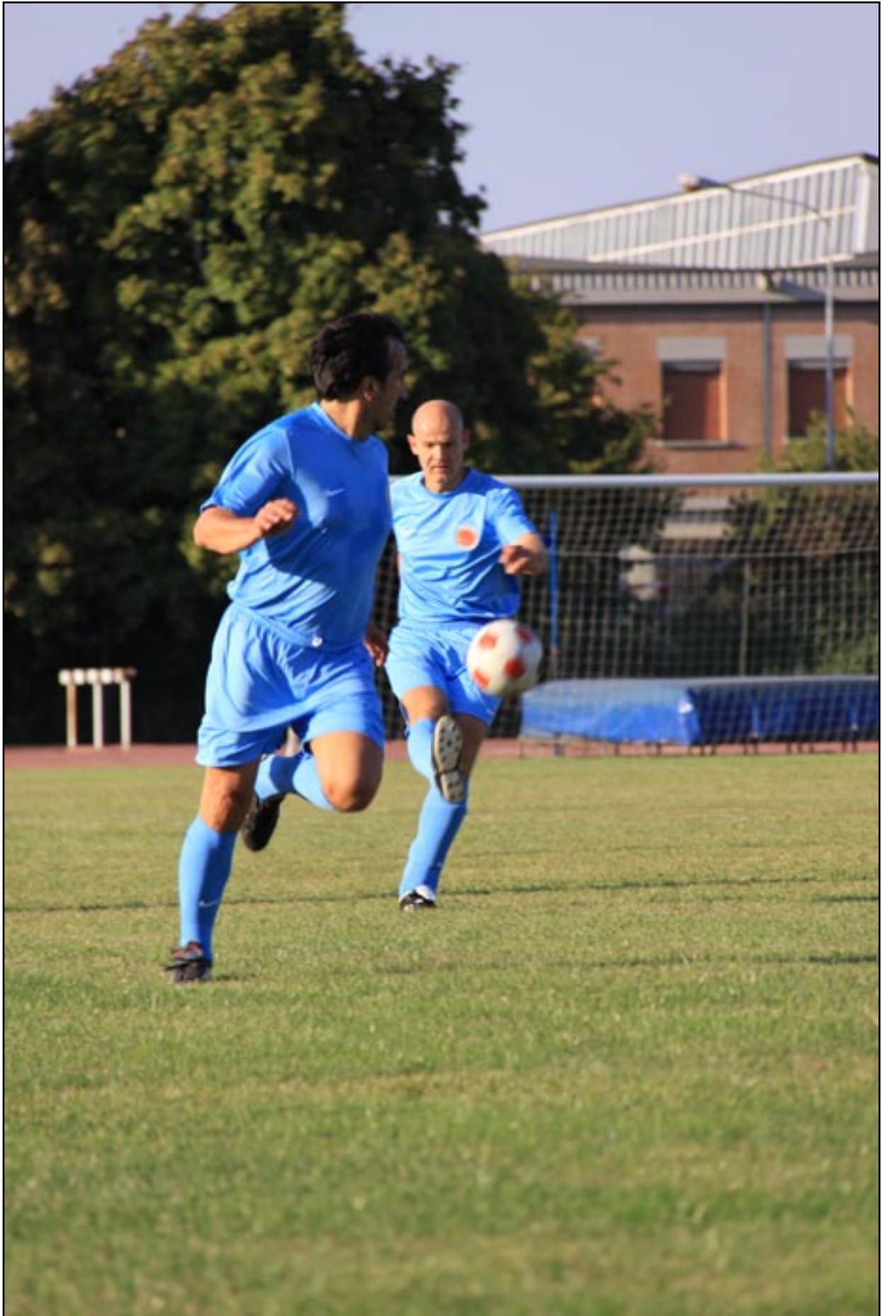
A PERFECT LAUNCH