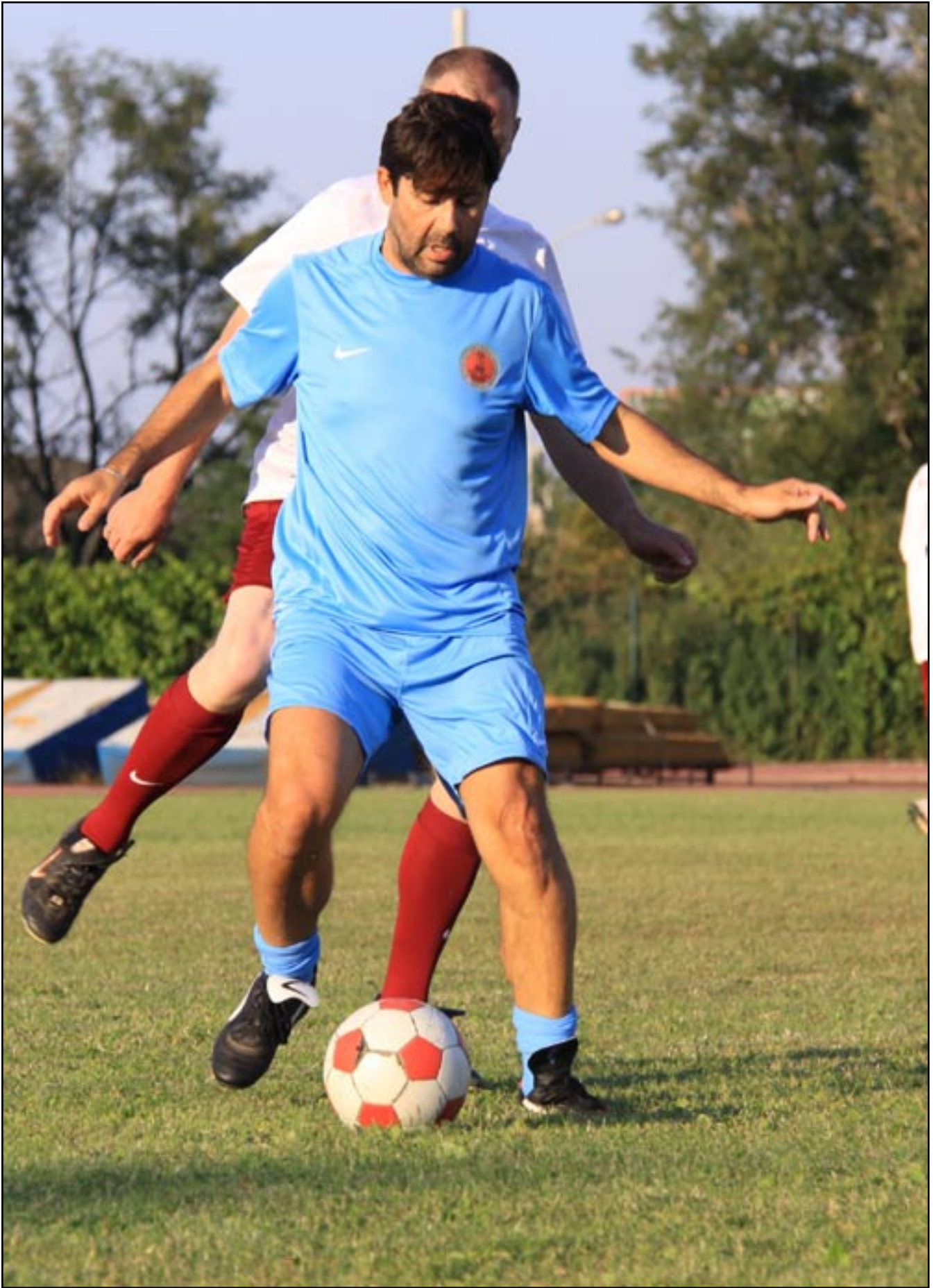
HOW TO DEFEND THE BALL