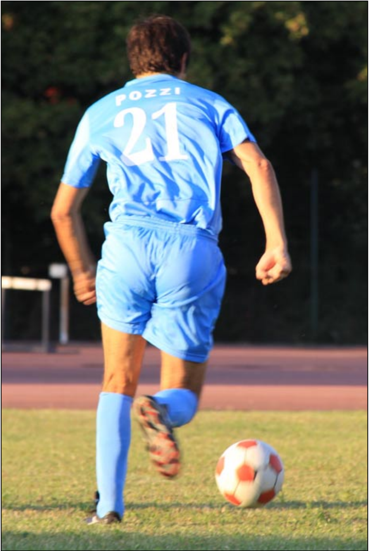
THE OBSCURE SIDE OF THE STRENGTH