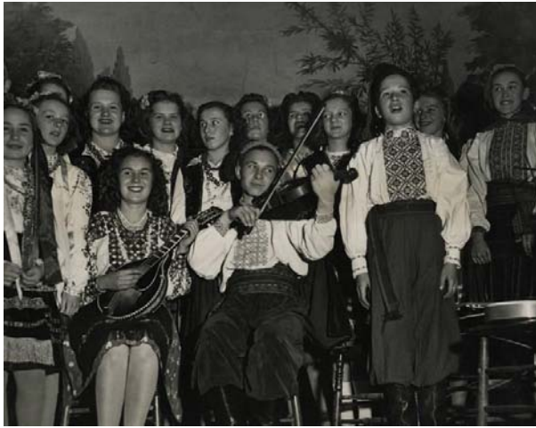
8 KEYSTONE. Ukrainian-Canadian girls with embroidery. London, 1947. Original photograph, gelatin silverprint, 20,6 x 25,2 cm. 60,00