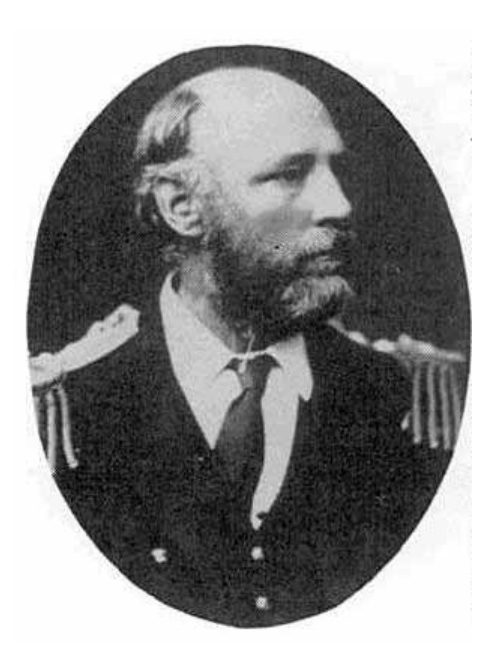
Commodore James Erskine RN, later Admiral of the Fleet.