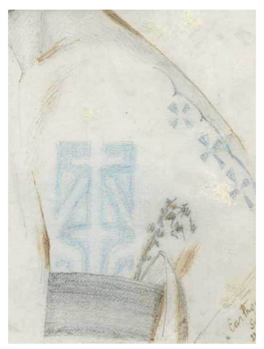
Detail of tattoos to Koapena's upper arm and shoulder blade added by Miklouho-Maclay and used to date this work following the Kalo events of 1881