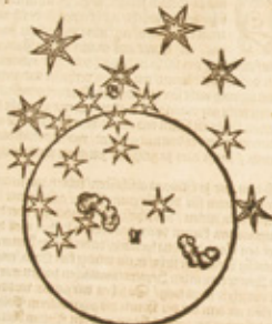
Der Polus Westwärts. Des Creutz.

nen und die Länge der Flache durch einen Kreisbogen / da befinden sich Kaufschiffe / das Weizen in jenen der große / kumpen einen kleinen Stern mitten bedeckten / die gangen in einen recht geringen herum und der Polus / also das sie für und für ein noch auf nicht denn ein weil inder abgehen / dageschicht bey auß Zeichen weit von bemittelt Pol / Ob den kumpen ein mander dreytes Creutz von fünf Sternen / darinnen stehen ein ander große Stern / wie bey uns beide der gros und klein Weizen sein in jeder / die alle um den Polus des in sie dreifly / Zwei weit herum gezogen / und doch nach dem Lauf in vier und zwanzig Stunden / mit des alle ein jüdisches Scheit / fünf Scheit / das ist fünf ander Beiten am Himmel weit / das dörren dem kumpen sehen nach / zu vergleichen ihn nach / wie ein noch so genider fünf abziehen.