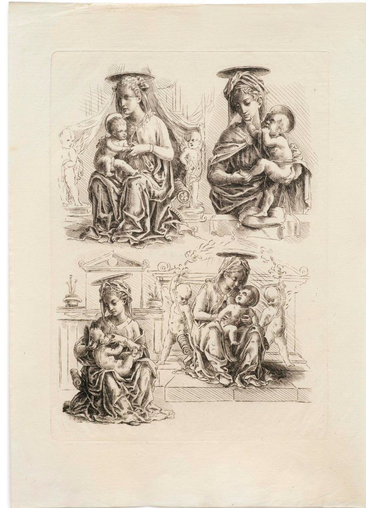
Fig. 11. Print [43], in first state (before letters)

BM 1920,1211.44 (second state, numbered above image to the right: 38; lettered below image with production details: A Mantegna dis | F Novelli inc ) For details on the drawing see 1920,0214.1.24 verso ( image )