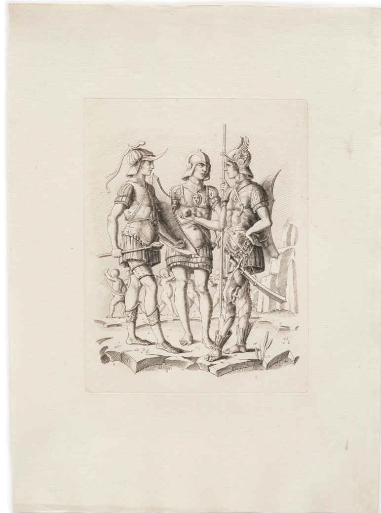
Fig. 5. Print [29], in first state (before letters)