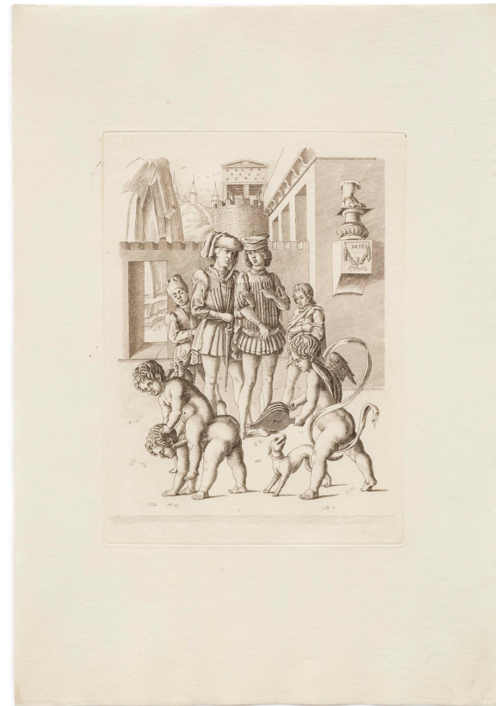
Fig. 1. Print [35], in first state (before letters)

and his contemporaries , exhibition catalogue by Hugo Chapman, British Museum, Department of Prints and Drawings (London 1998), pp.64-67 no. 15.