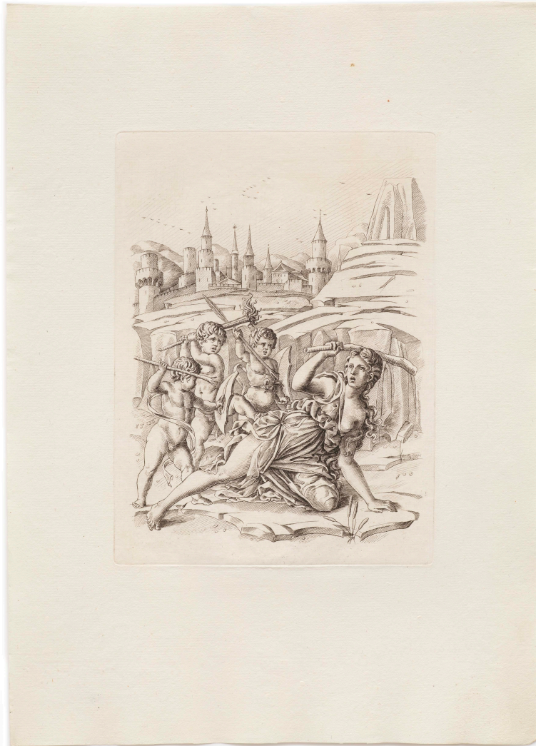
Fig. 9. Print [15], in first state (before letters)

For details on the drawing see 1920,0214.1.6 recto ( image )