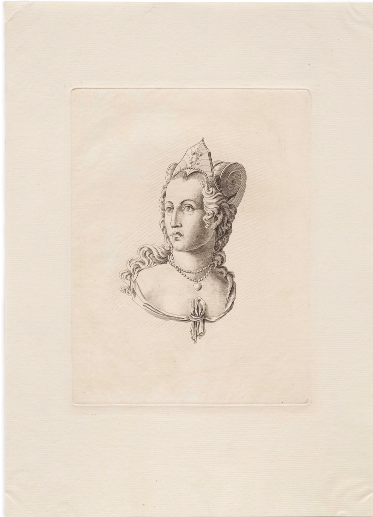
Fig. 10. Print [32], in first state (before letters)