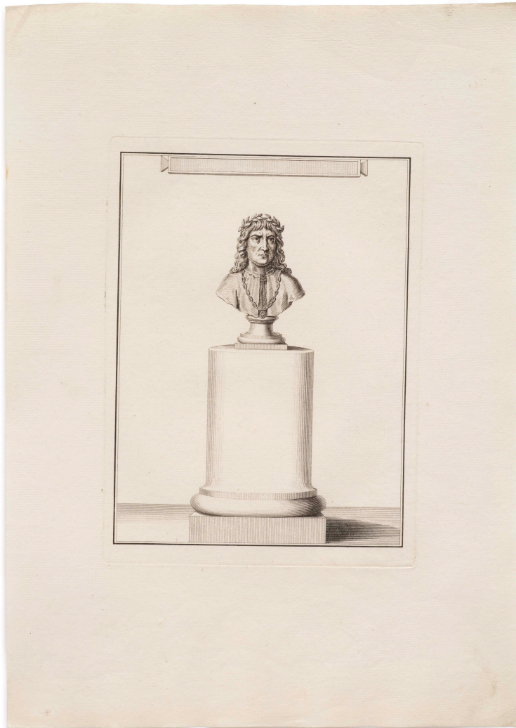
Fig . 7. Title-print, in first state (before letters)

principes | palman. adepti | obiit. mantuae. mdvi. men. sept. | M.P.D.N.M.Q.E.M.B. , lettered below image with production details: Franciscus Novelli inc.