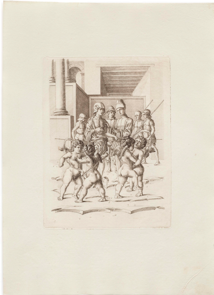
Fig. 2. Print [17], in first state (before letters)