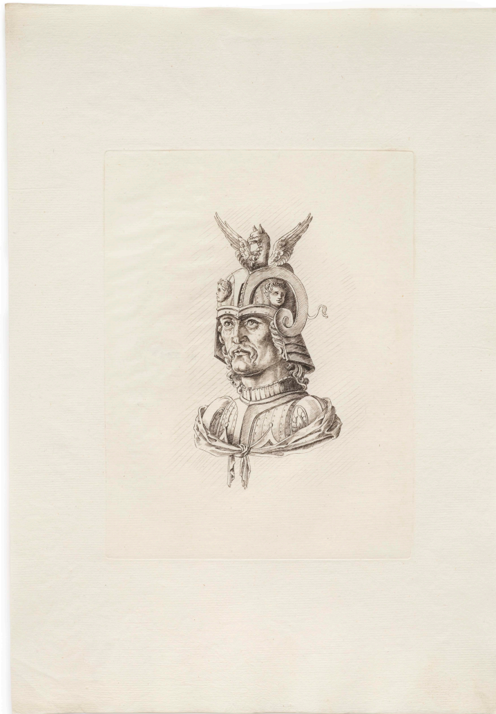
Fig. 8. Print [8], in first state (before letters)

230 × 172 mm (plate-mark), 345 × 287 mm (sheet)