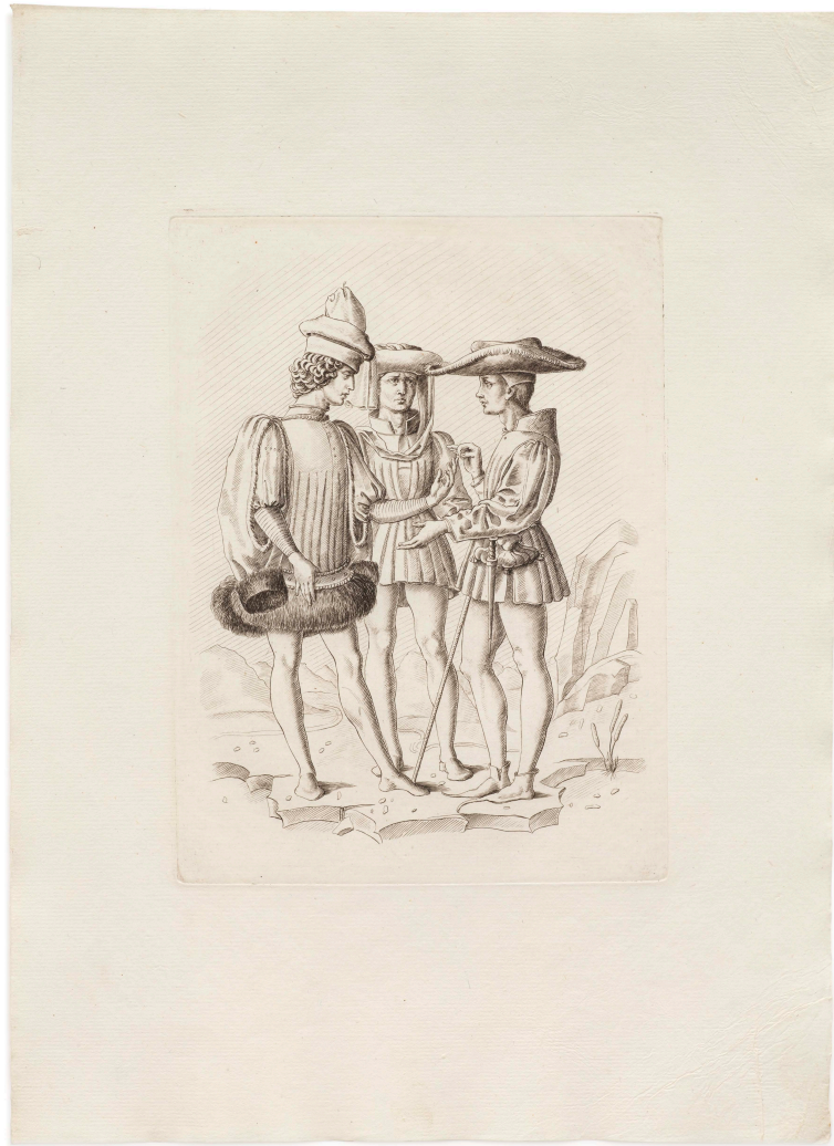
Fig. 4. Print [19], in first state (before letters)