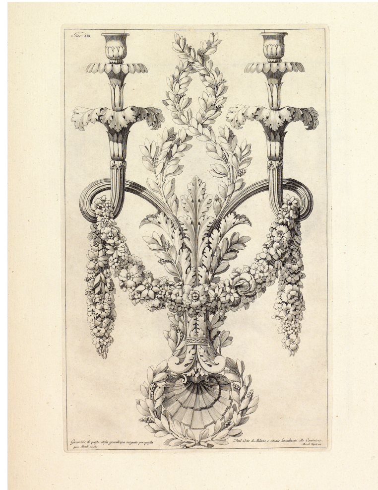
Fig. 3 Two-light girandole designed by Giocondo Albertoli for the Palazzo Arciduciale in Milan (from Ornamenti diversi , pl. XIX; platemark 420 × 265 mm)