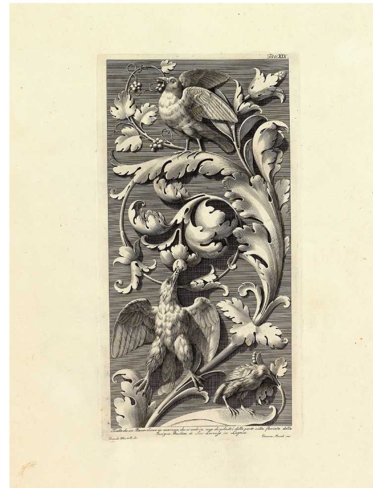
Fig. 4 Marble bas-relief designed by Giocondo Albertolli for the Cattedrale di San Lorenzo in Lugano (from Miscellanea per i giovani studiosi del disegno , pl. XIX; platemark 333 × 172 mm)