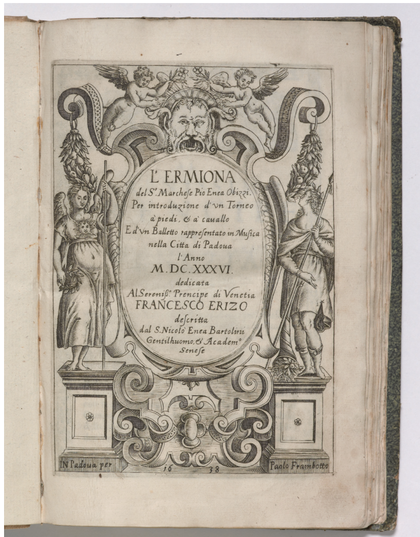
Fig. 1 Title-page (page height 270 mm)