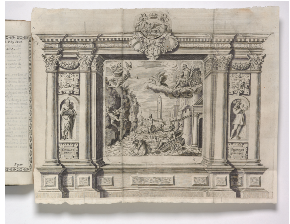
Fig. 2 Act 1: 'Il Rapimento d'Europa', scene 2. Stage setting by Alfonso Rivarola detto il Chenda (sheet 320 × 400 mm)

165 × 165 mm) framed by the same proscenium plate (the curtain now masked). 6 Steps at the front of the stage suggest that part of the performance took place on the floor of the hall (see Fig. 3).