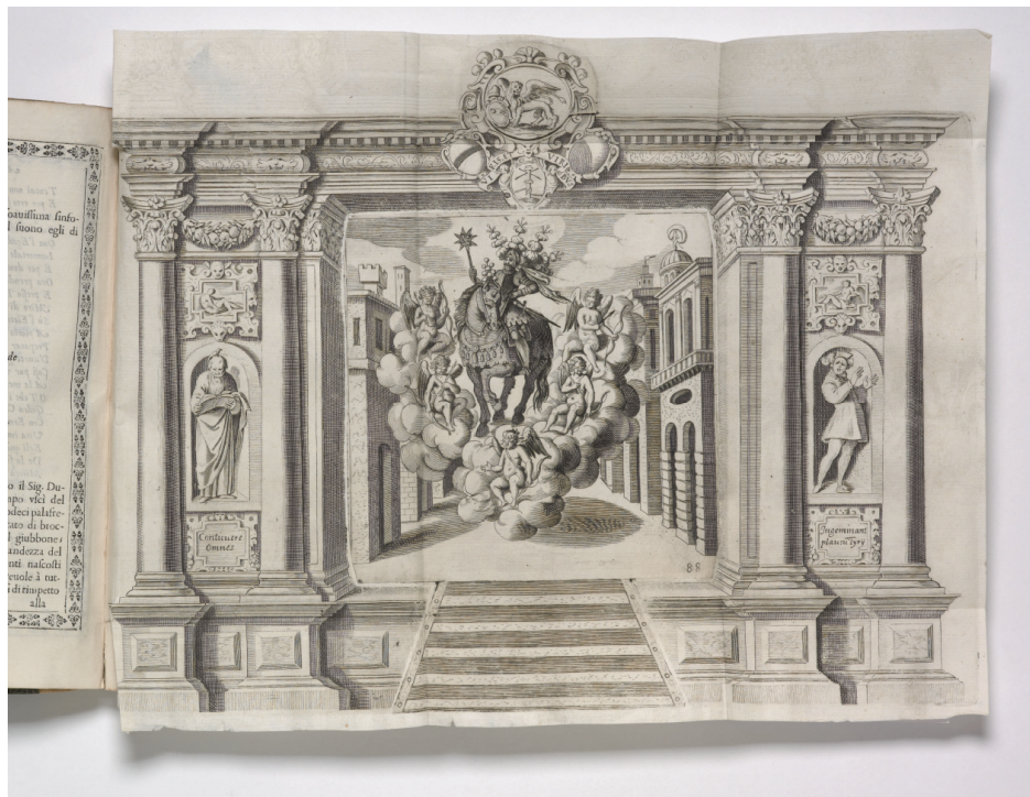
Fig. 3 Act III: 'Gli Imenei', scene 5. Stage setting by Alfonso Rivarola detto il Chenda (sheet 320 × 400 mm)

Before the curtain was raised, a dance was performed. Bartolini describes the scene: