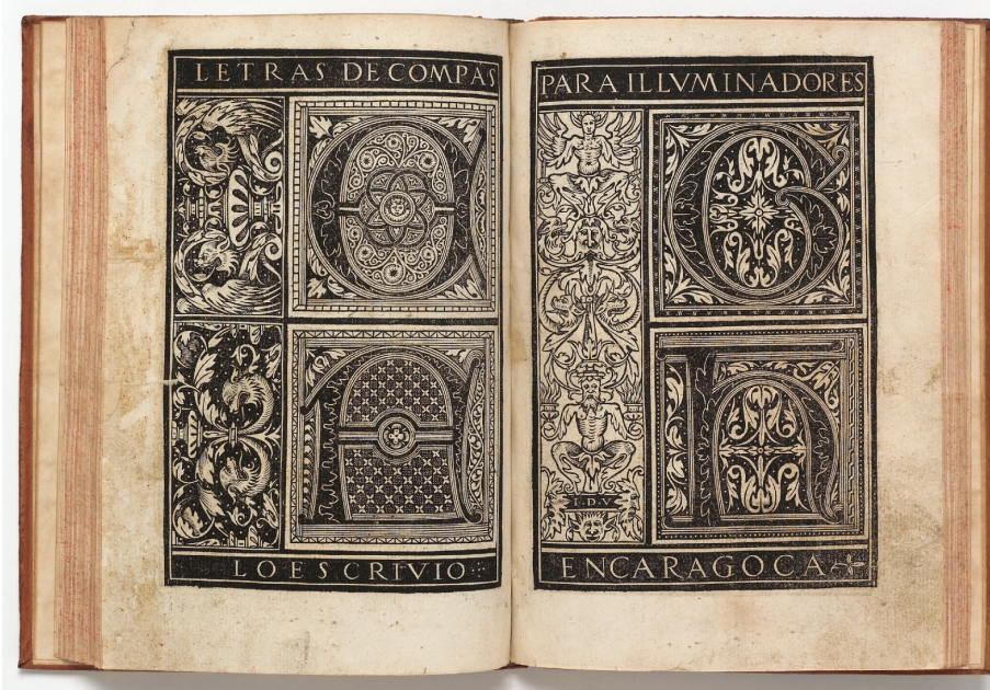
Fig. 4. ‘Letras de Compas para Illvminadores’, cut by Juan de Vingles. Page height 194 mm

The woodblocks of the first edition are re-employed in the second edition, except for three (two models of a ‘Letra Gotica Echada’ and a ‘Trata de la letra tratizada’, folios D5 recto–D5 verso, D6 verso in the 1548 edition). To their number, twenty-four ‘Tablas mas estudiadas y mas esmeradas que antes’ (‘Epistola Al Lector’, A3 verso) were added, and these enlarge the book by two gatherings (sixteen leaves). One of the new blocks is dated 1547, seven are dated 1550, and sixteen are undated. 3