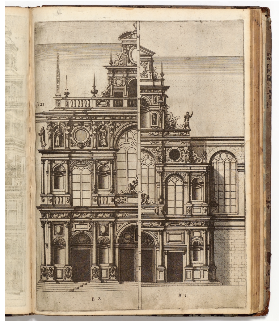
Fig. 3 Architectura, oder Bauung der Antiquen (folio 21). Platemark 345 × 260 mm