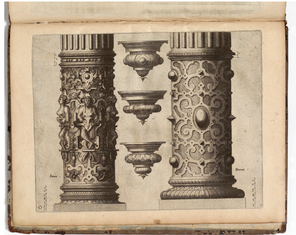
Fig. 2 Das Erst Buch (folio O). Platemark 240 × 304 mm

Fore-edge margin of Architectura, oder Bauung der Antiquen repaired at an early date, two paper flaws in plate 9 (a round 5 mm hole in blank area; a 10 mm tear in design), but otherwise a very good copy; the three other works in fine state of preservation.