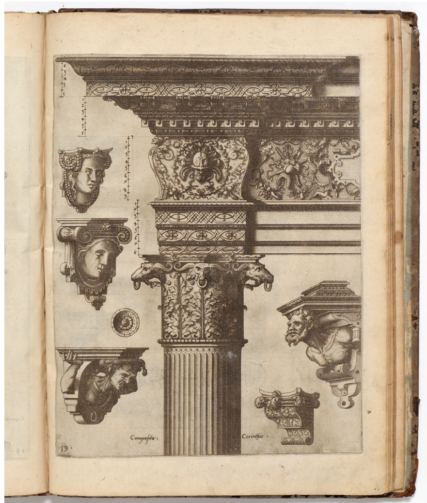
Fig. 1 Das ander Buech (folio 19). Platemark 305 × 238 mm