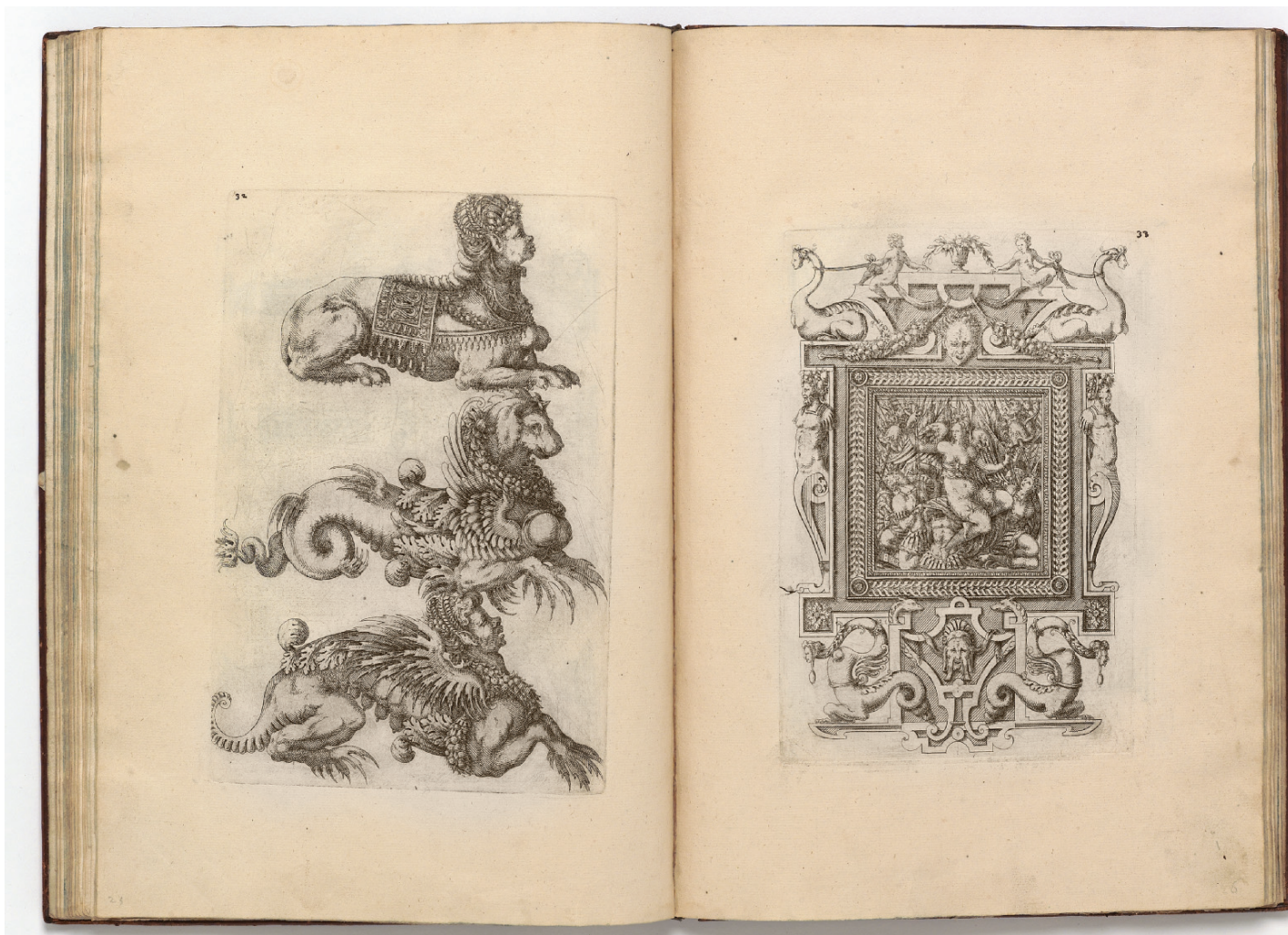
Fig. 3: Print 32, Trois chimères, vues de profil (platemark 210 × 142 mm). Print 33, Un panneau représentant la Victoire avec des trophées (platemark 190 × 130 mm)