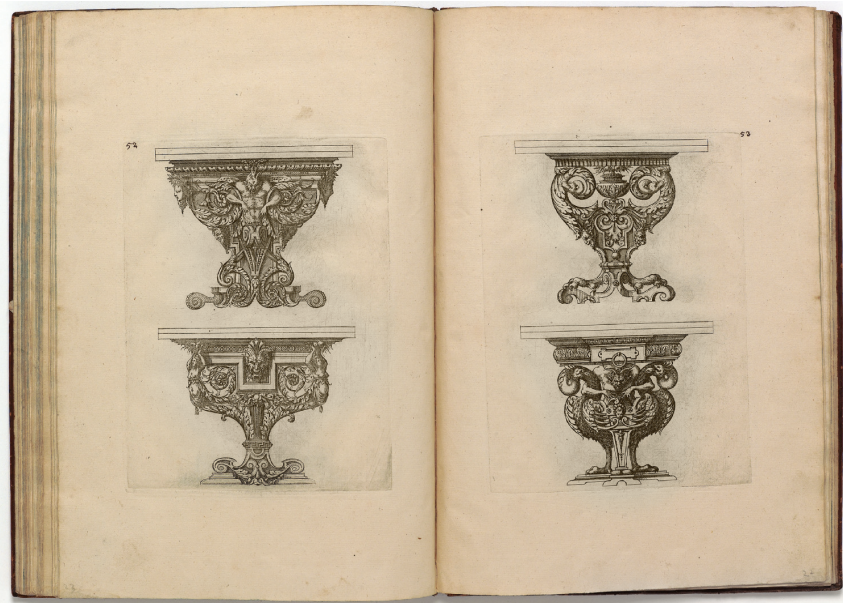
Fig. 7: Prints 52 and 53, Tables (platemarks 188 × 142 and 192 × 143 mm)