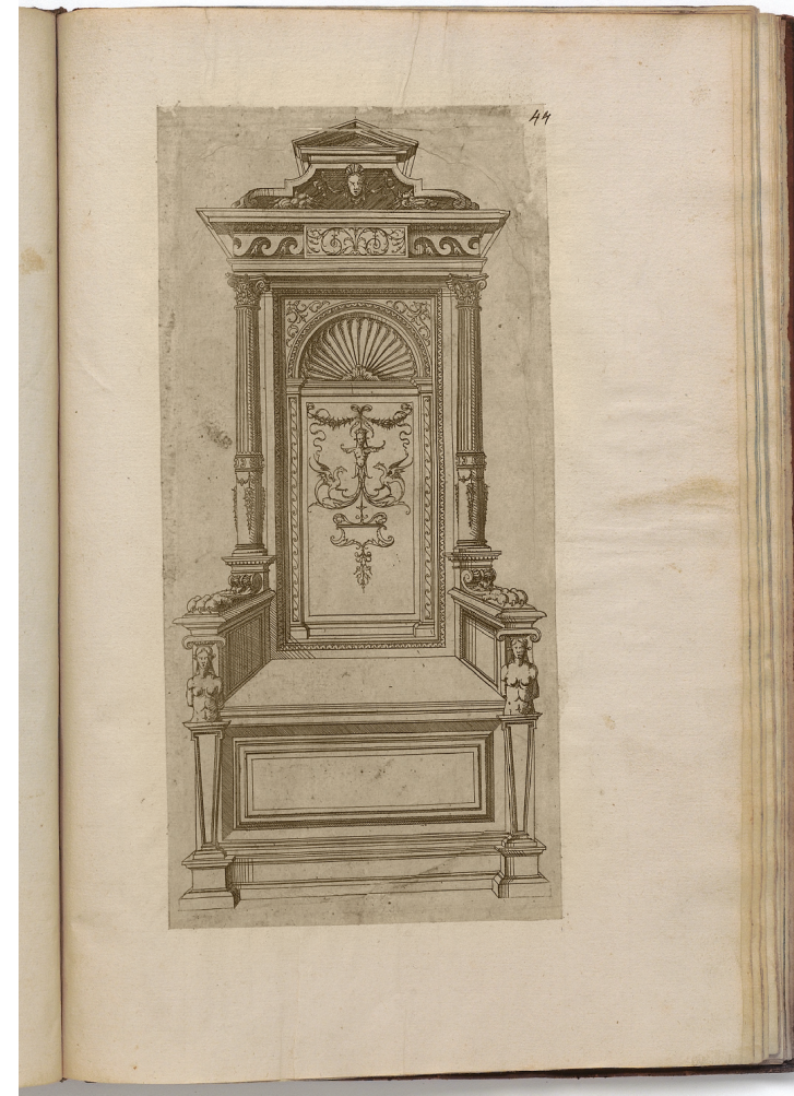
The only impression known