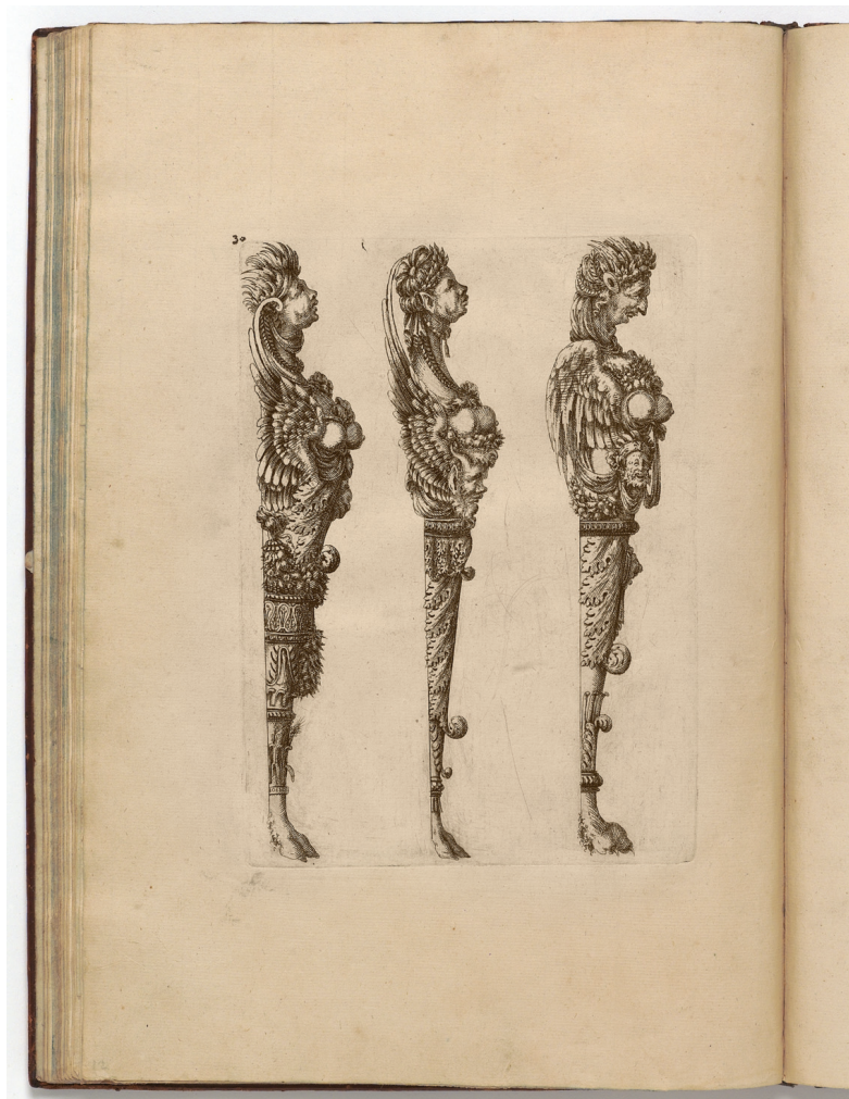
Fig. 4: Print 30, Trois termes ou cariatides, de profil (platemark 185 × 136 mm)

in our volume) identifies Du Cerceau as designer or etcher or publisher and carries a date (1550), 10 all the others are anonymous and undated. It seems that some matrices were etched while Du Cerceau was still working in Orléans; the great majority, however, appear to have been made after he established himself in Paris (1550 or 1551), and to date from the early 1560s, before he took refuge in the Huguenot sanctuary at Montargis (1565). Although Du Cerceau routinely copied or adapted the designs of others, his models of furniture are not derived from known prints. 11