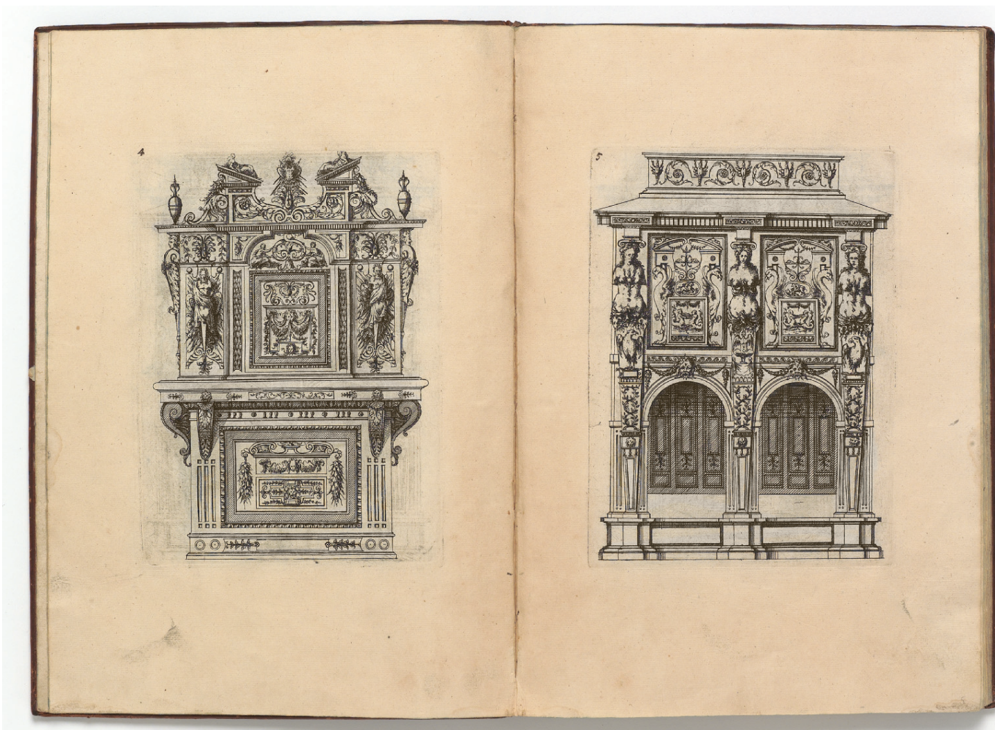
Fig. 2: Prints 4 and 5, Cabinets et dressoirs (platemarks 189 × 139 and 191 × 142 mm)