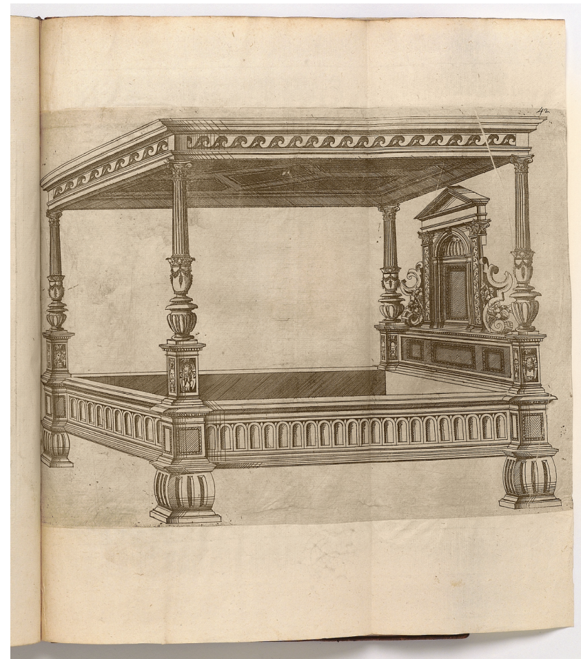
Fig 5: Print 42, Lit style Henri II (210 × 287 mm, trimmed within platemark)

1596) and Jacques II (died 1614). A comprehensive investigation will likely prove the existence of many more reissues of the furniture prints than are now recognised.