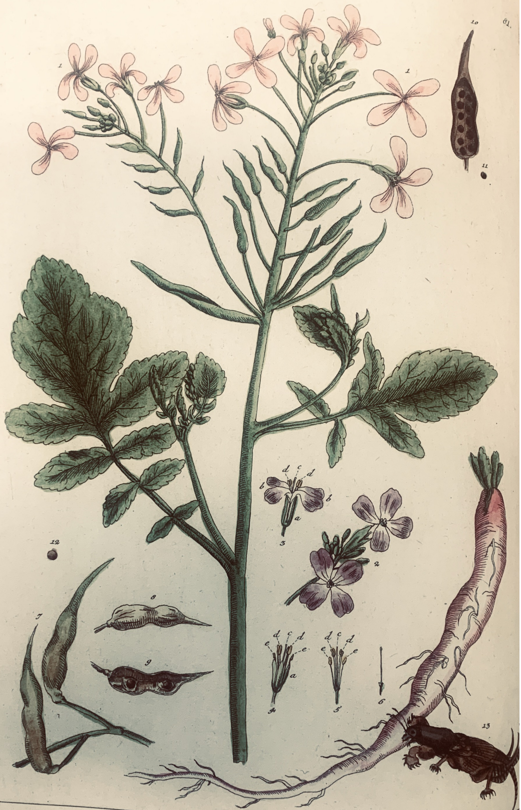
Raphanus hortensis. { 1-6. Blume. 7-10. Frucht. 11, 12. Saame. 13. Ackerwühl. Ganger Garten Rettig.