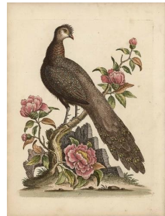
Plate # 67 from George Edwards "A Natural History of Birds, Most of which have not been figured or described and others very little known..." published in London between 1743 and 1751. This plate, dated 1745 in the plate, features a beautifully colored pheasant. Edwards, a friend of Sir Hans Sloane and Mark Catesby, is a pivotal figure in ornithological history. Other engravings from this series are available. US$285.00

Hand colored copperplate engraving, plate size approximately 10 1/4 x 7 1/2 inches on sheet 11 1/2 x 9 inches. A few light foxed spots and toning to edges. Signed in the plate. With text sheet. George Edwards. London. 1743-1751.