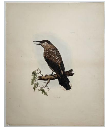
Plate XXXIII from the 1841 edition of Plates to Selby's Illustrations of British Ornithology. US$325.00

Atlas folio engraving with handcolor, image area approx 15 x 11 1/2 inches on wove paper 26 3/4 x 21 1/4 inches. Pinholes at corners, multiple short edge tears up to 1 inch, 1/4 inch chip to left lower edge, binding holes to left edge (all of the above well outside image area); scattered light marks, some in image area; white tape from hinging in short sections along left and right edges of verso; overall very good condition. [Bohn]. [London]. 1841.