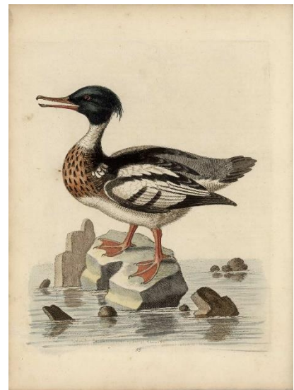
Plate # 95 from George Edwards "A Natural History of Birds, Most of which have not been figured or described and others very little known..." published in London between 1743 and 1751. This plate, dated December 1745 in the plate, features an attractive bird of middle size, "between a Duck and a Goose". Edwards, a friend of Sir Hans Sloane and Mark Catesby, is a pivotal figure in ornithological history. A North American native, "brought from Newfoundland." US$265.00

Hand colored copperplate engraving, plate size approximately 9 1/4 x 7 1/2 inches on sheet 11 1/2 x 9 inches. A few light foxed spots. Signed in the plate. With text sheet. George Edwards. London. 1743- 1751.