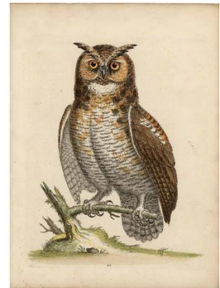
Plate # 60 from George Edwards "A Natural History of Birds, Most of which have not been figured or described and others very little known..." published in London between 1743 and 1751. This plate features a brightly colored horned owl. Edwards, a friend of Sir Hans Sloane and Mark Catesby, is a pivotal figure in ornithological history. US$265.00

Hand colored copperplate engraving, plate size approximately 9 1/2 x 7 1/4 inches on sheet 11 1/2 x 9 inches. A few light foxed spots and toning to edges, soft diagonal crease to upper right image. Signed in the plate. With text sheet. George Edwards. London. 1743- 1751.